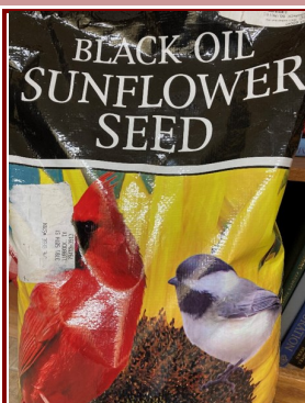
Fig. 1. Sunflower seed for bird feeding, a product that emphasizes “black” as suitable for bird feeding. (Calvin Trostle)