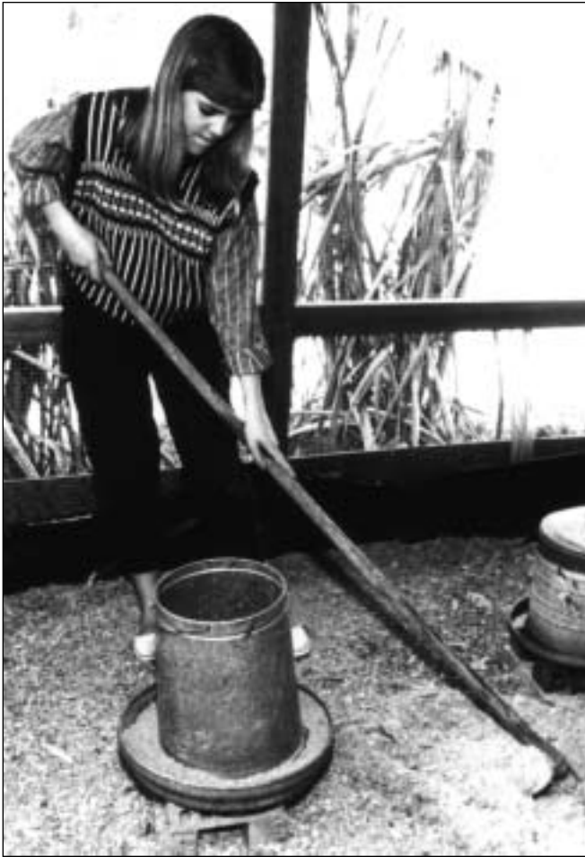
Stir the litter daily to prevent packing. Damp or caked litter will cause health problems and affect bird performance.

dry sawdust, peanut hulls or rice hulls make good litter. Hay makes very poor litter. Keep all sticks, boards and sharp objects away from the broiler house.