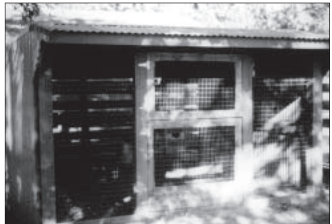
A typical building used for growing broilers or roasters for a youth project.

Be prepared for the chicks 2 days in advance. Put at least 4 inches of litter on the floor of the cleaned, disinfected house. Wood shavings, cane fiber, coarse