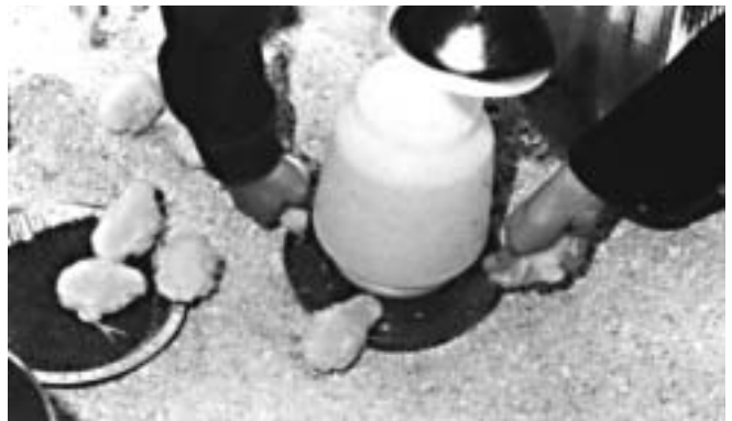
Water, feed and a heat source are all essential in getting chicks off to a good start.

Optimum performance is dependent on proper nutrition. The feed dealer should be informed of the type of feed required at least 2 weeks before chicks arrive so that fresh feed can be ordered. It is absolutely essential that birds receive a high-quality poultry