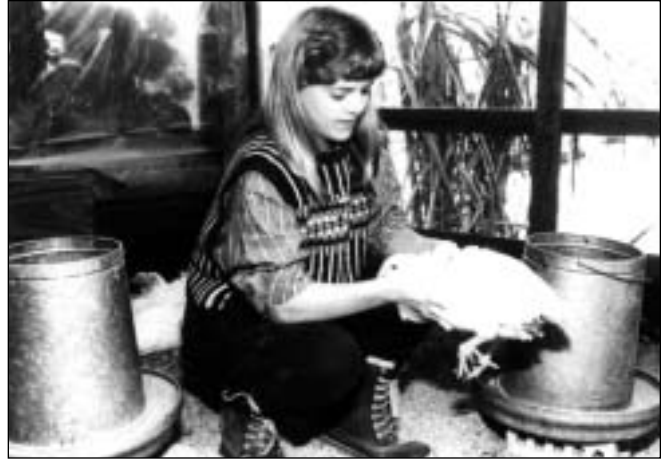
Handle birds carefully. Keep feeders and waterers level with the back height of the birds.

Snub the top beaks of birds if feather picking or cannibalism starts. Trim one-third of the upper beak with an electric beak snubber. Vicks® salve or an anti-peck compound applied to the bloody pecked