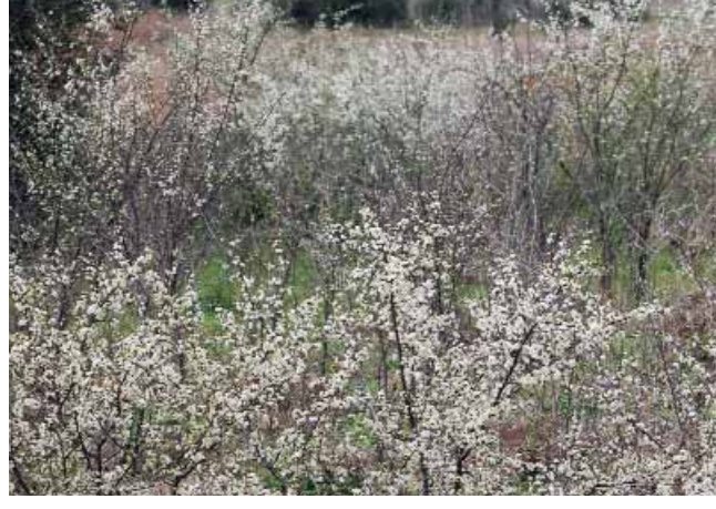
Sand plums provide necessary cover for upland game.