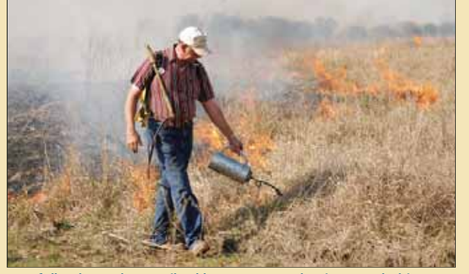
Carefully planned prescribed burns are used to improve habitat.