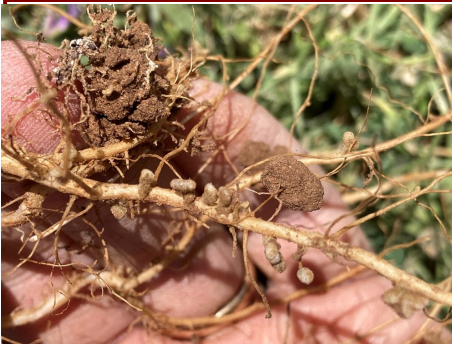
Fig. 1. Rhizobium nodules on fall-planted hairy vetch, McLennan Co., May 2024. The seed was pre-treated by the seed dealer with the appropriate crop-specific inoculant. Nodules when sliced were red inside, actively fixing nitrogen. (Calvin Trostle.)