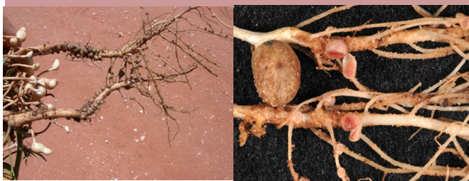
Fig. 3. Bradyrhizobium nodules on a peanut taproot (left) are evidence a crop-specific inoculant product was used to foster nitrogen-fixing nodule formation. The sliced nodules with pink or red (right) signify active N fixation, or conversion of nitrogen in the air to a form plants can use (Calvin Trostle, reprinted from TAM-AAMM, 10/30/2023).

6. Follow-up with needed information to fill any gaps in clientele knowledge. Ask your regional specialist or myself for help if needed.