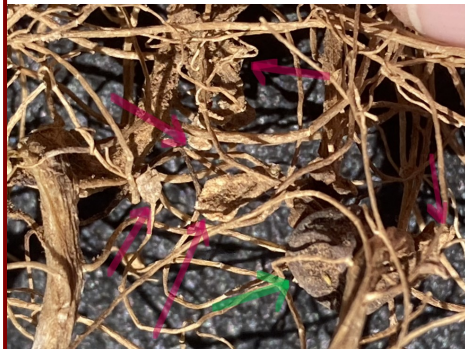
Fig. 2. Rhizobium nodulation on fall-planted Austrian winter pea, Castro Co., May 2024. Seed was treated with crop-specific inoculant before planting. Red arrows point to active nodules (which have a warty appearance). Green arrow is an older nodule that has senesced and is no longer active. (Kristie Keys.)