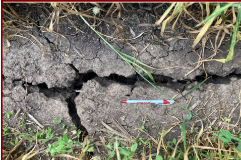
Fig. 1. A typical crack in many Texas soils when dry and droughty conditions prevail. This shrink/swell soil at the Texas A&M AgriLife Research Field southwest of McGregor, McLennan Co., is likely Houston Black clay. The plants are wheat plus an interseeded clover (at bottom). (Calvin Trostle, May 8, 2024.)