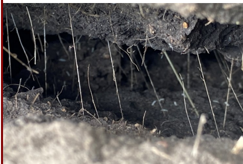
Fig. 2. What do you see? A closer look into the McGregor soil cracks shows stretched and killed roots from adjacent wheat and clover. Root capacity has been reduced. Closure with rain will not restore lost root mass. (Calvin Trostle, May 8, 2024.)

Example: We've all seen large cracks in dry soils. McLennan Co. soil reveals an odd twist.